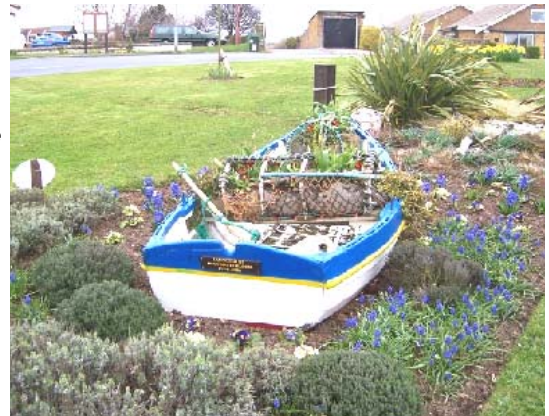
The Boat Bed